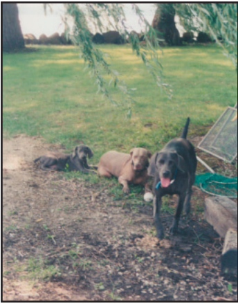
Pictured Above: (front to back) River, Willow, and Hunter