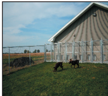
Two Dogs Enjoy Their Playtime

Our 8 indoor/outdoor kennels with in-floor heating and air conditioning are regularly being requested for weekend and full week stays.